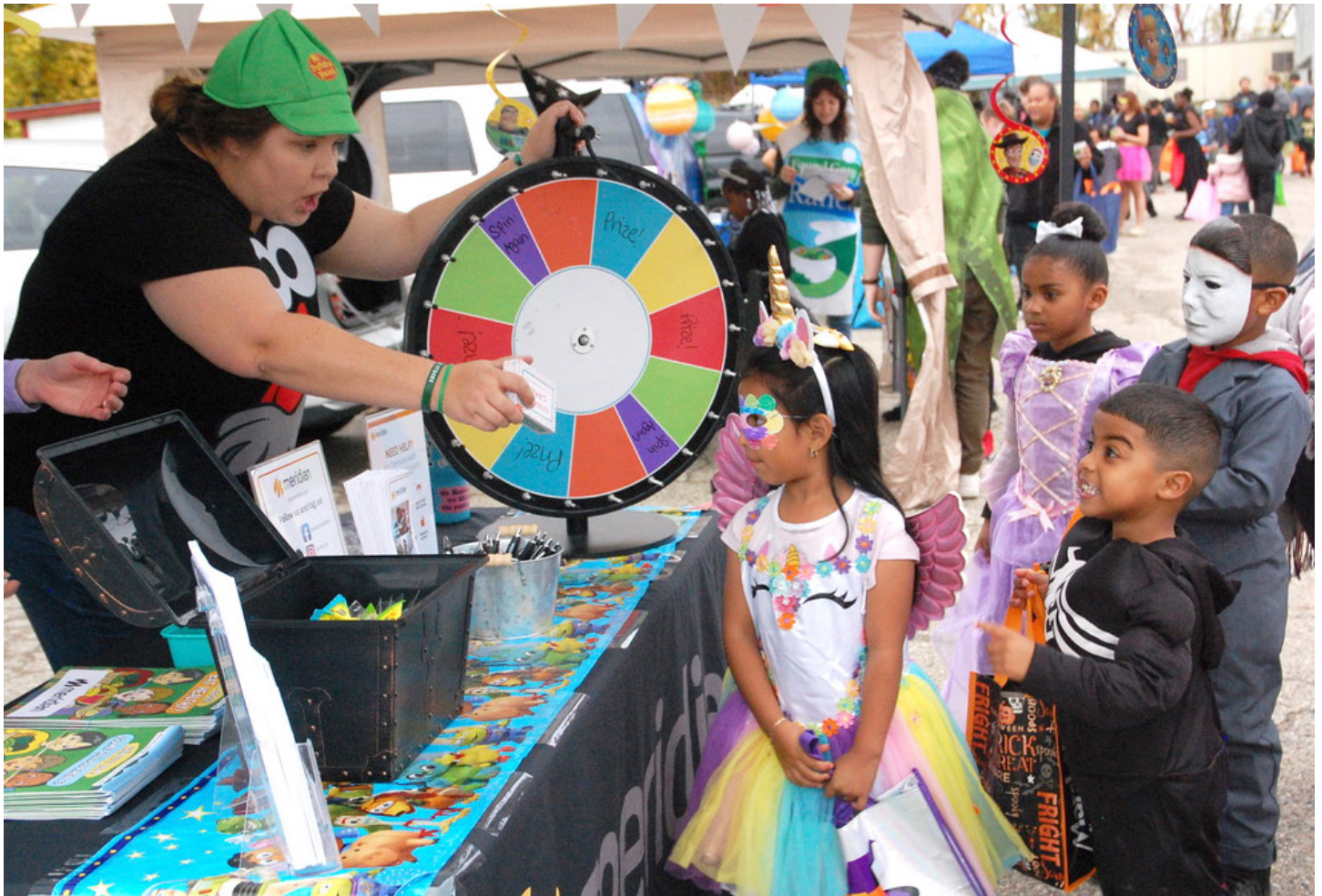
Trunk or treat event hosted by Healthy Homes of West Michigan to educate families and share resources on lead poisoning prevention.

New in 2024, we plan to establish work groups to take a deep dive on rental property code enforcement and to share best practices and move agendas forward within parent-led groups.