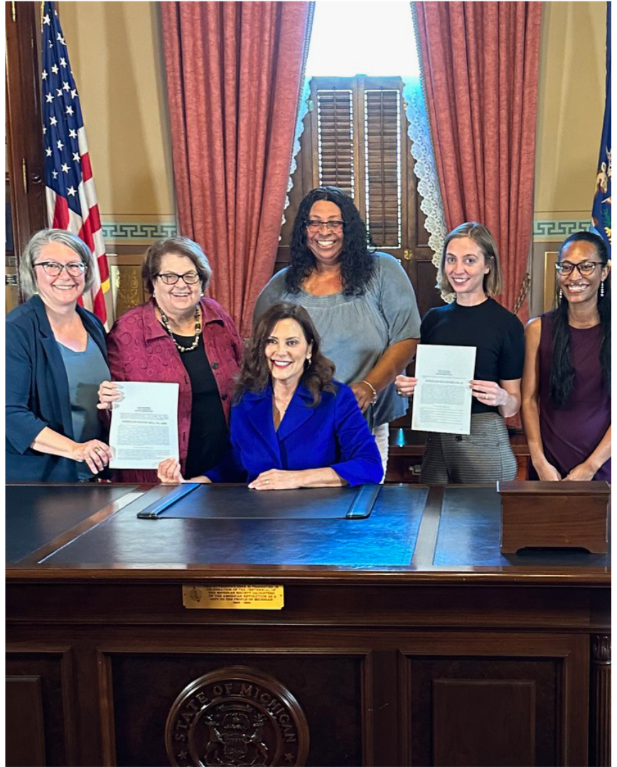
Ecology Center, DLEAD, and MEC join MI Gov. Whitmer for Universal Lead testing bill signing.