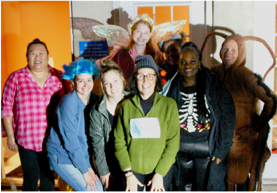
Healthy Homes Coalition of West Michigan lead education event.