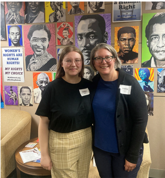
Ecology Center at lawmaker education day in Lansing, MI.